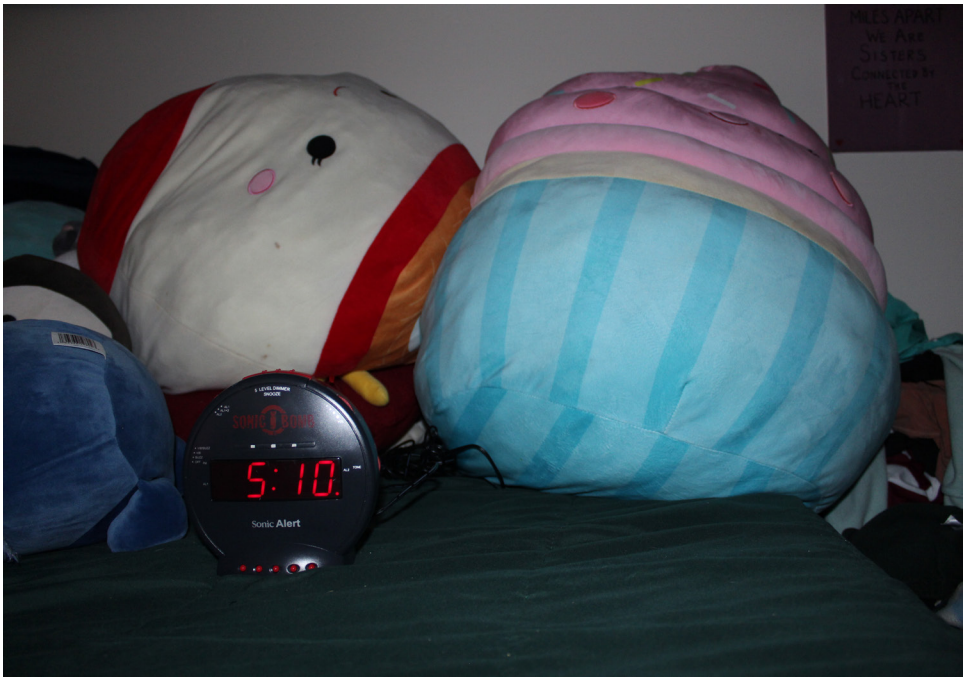
Rise and Shine. Maddi's alarm clock at 5:10 am starting her day in East Lansing, Michigan, on March 27, 2024.