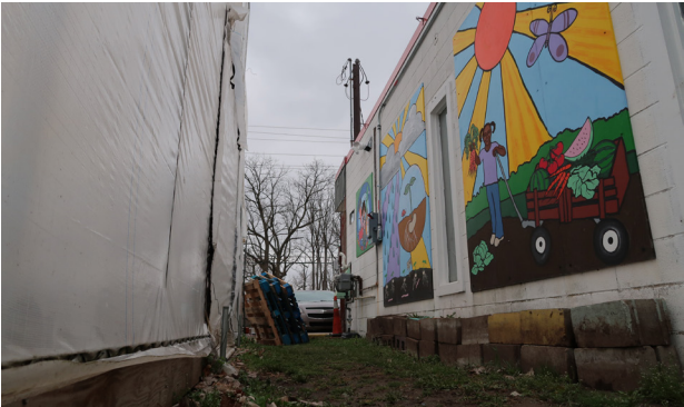
The Southside Community Coalition Community Center Hoop House and beautiful artwork on the building in Lansing, Michigan, on March 27, 2024.