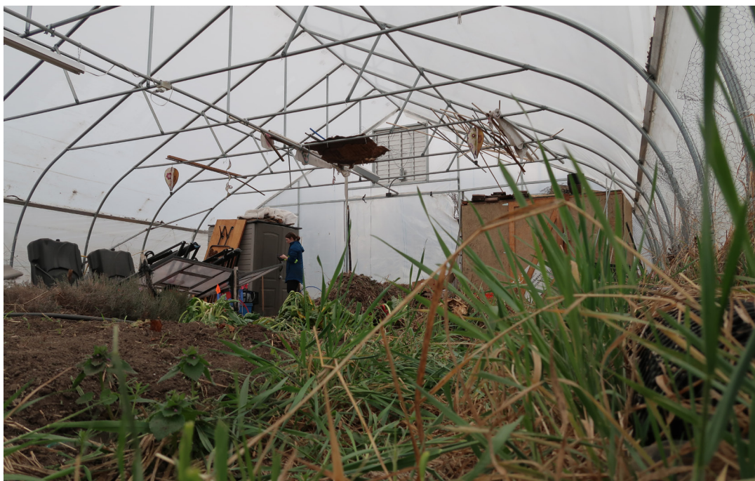
The Southside Community Coalition Community Center Hoop House in Lansing, Michigan, on March 27, 2024.