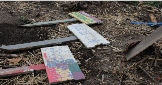
Eggplant, Beets and Spinach garden signs on the ground of the Hoop House in Lansing, Michigan, on March 27, 2024.